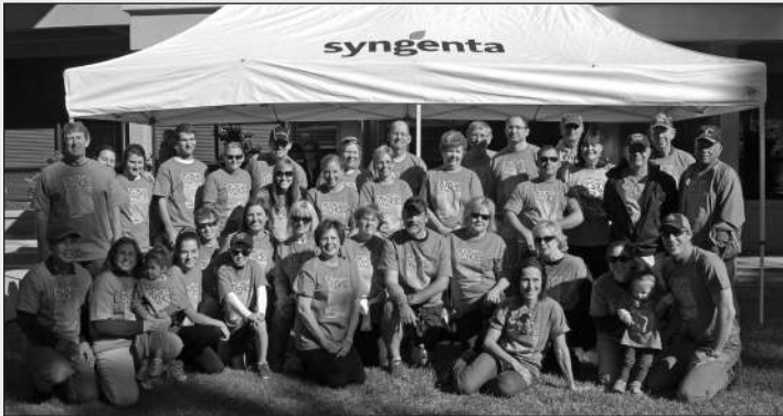
▲ Team Syngenta was out in full force along with a ton of Jambalaya for the Hunger Walk held in November at the Catholic Diocese. While hundreds made the walk, the team from St. Michael's took the first spot as top fundraisers for the walk.