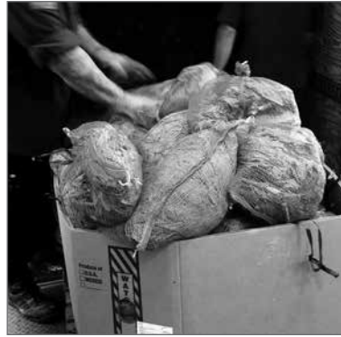
▲ A special thanks to the Louisiana State Penitentiary at Angola for their recent donation of a truckload of mustard greens freshly picked, packed and delivered to your Food Bank.