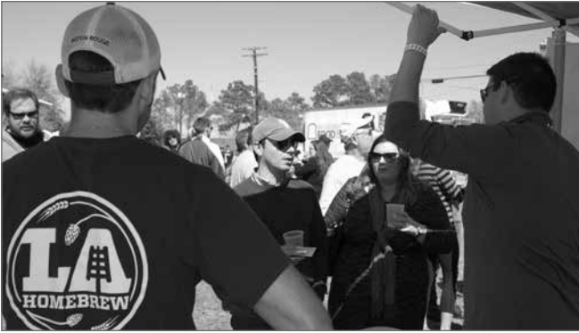
▲ Beer enthusiasts sample home brewed beers at the 2015 Iron Brewer's Beer Festival hosted at Tin Roof Brewery. Entry simply required a donation of canned goods to the Food Bank.