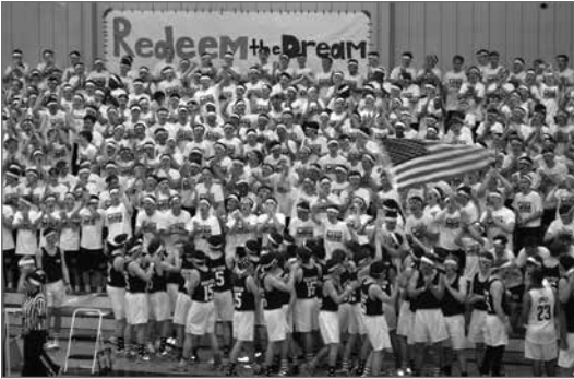
▲ The annual Challenge Day between Catholic High and St. Joseph's Academy was packed with entertainment, competitions, and activities, but most important of all is their combined efforts to collect over 95,565 pounds of food for your Food Bank. Their effort to raise awareness even included tweets from celebrities like Ellen DeGeneres, Brad Paisley, and Willie Robertson.