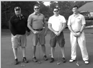
▲ Area golfers took a swing at hunger up at The Bluffs on April 9 as part of the Sparkhound Golf Tournament to benefit the Food Bank.