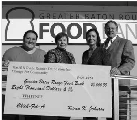
▲ A special thank you goes out to the Change for Community program, sponsored by the Al and Diane Kramer Foundation. Their donation of $8,000 collected from three local Chick-fil-A restaurants will provide food for approximately 40,000 meals.