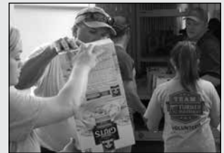
TEAM Turner employees unload an 18-wheeler full of collected food as part of their donation to restock the shelves for the critical summer time

South Baton Rouge Church of Christ Blue Bell Creameries Horne, LLP Woman's Hospital Desk and Derrick Club of Baton Rouge St. Frances Youth Group AmeriCorps Parks and Recreation of Denham Springs ExxonMobil ExC!TE Adopt-A-Senior Packers